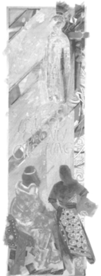
Jesus with Martha & Mary From the St. John's Bible

June 4: Christian Ethics from Women's Points of View: What issues are lifted up when women's voices count?